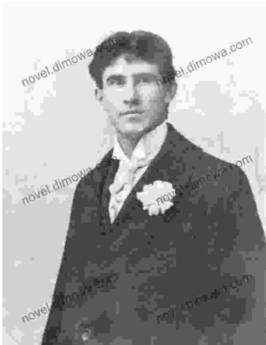
Student at Univ. of Pa. 1895

Zane Grey emerged as one of the most beloved and influential authors of the 20th century, captivating readers with his gripping tales of adventure set in the untamed wilderness. In "Meditations," Grey transcends the boundaries of fiction, sharing profound insights into the human experience, the wonders of nature, and the pursuit of meaning in a rapidly changing world.