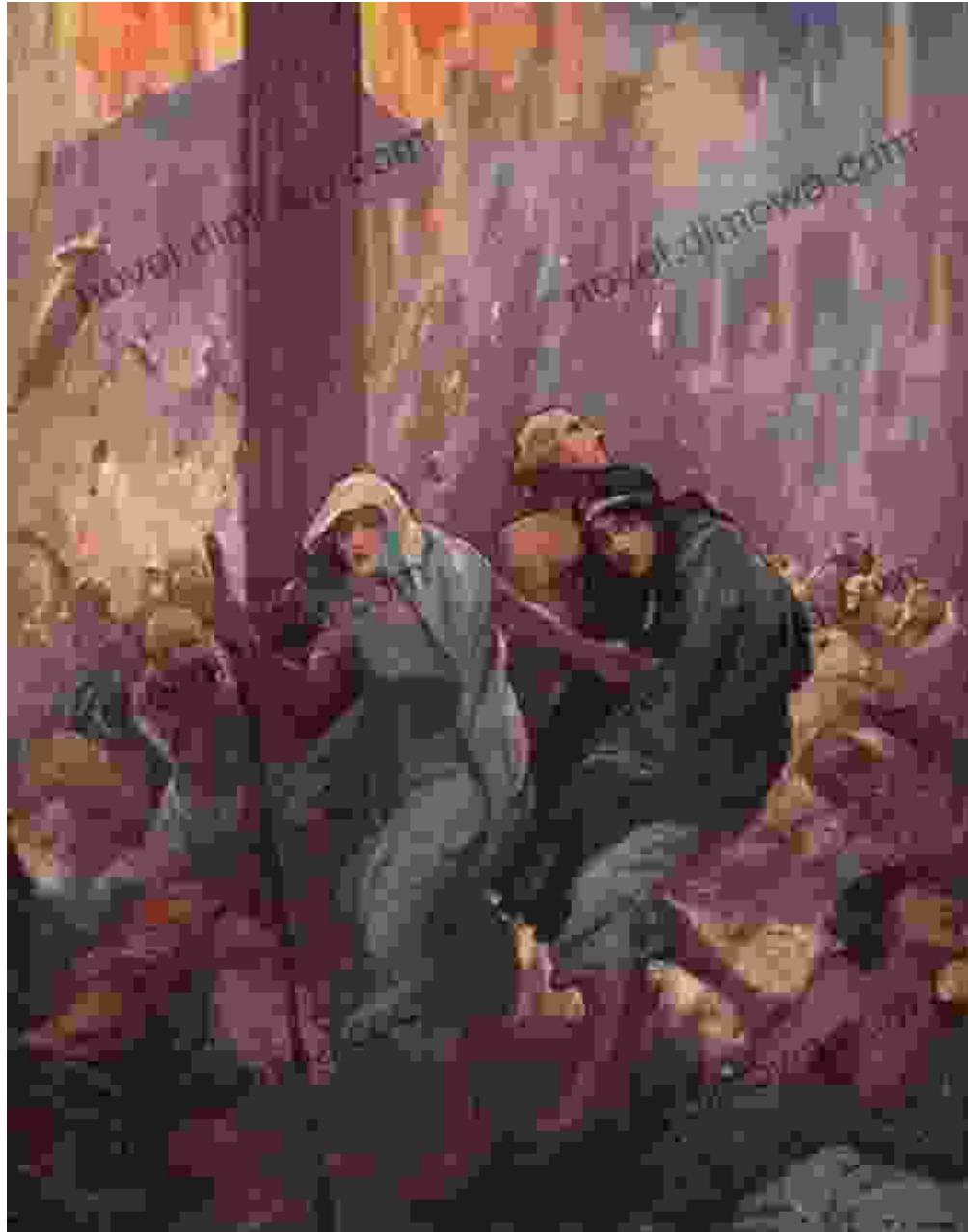
Glaucus and Lone, symbols of love and hope in the face of despair.

Other characters, such as the blind flower girl Nydia, the wise Egyptian priest Arbaces, and the corrupt edile Pansa, represent the diverse social fabric of Pompeii. Their stories intertwine, creating a complex web of relationships and motivations that add depth and realism to the narrative.