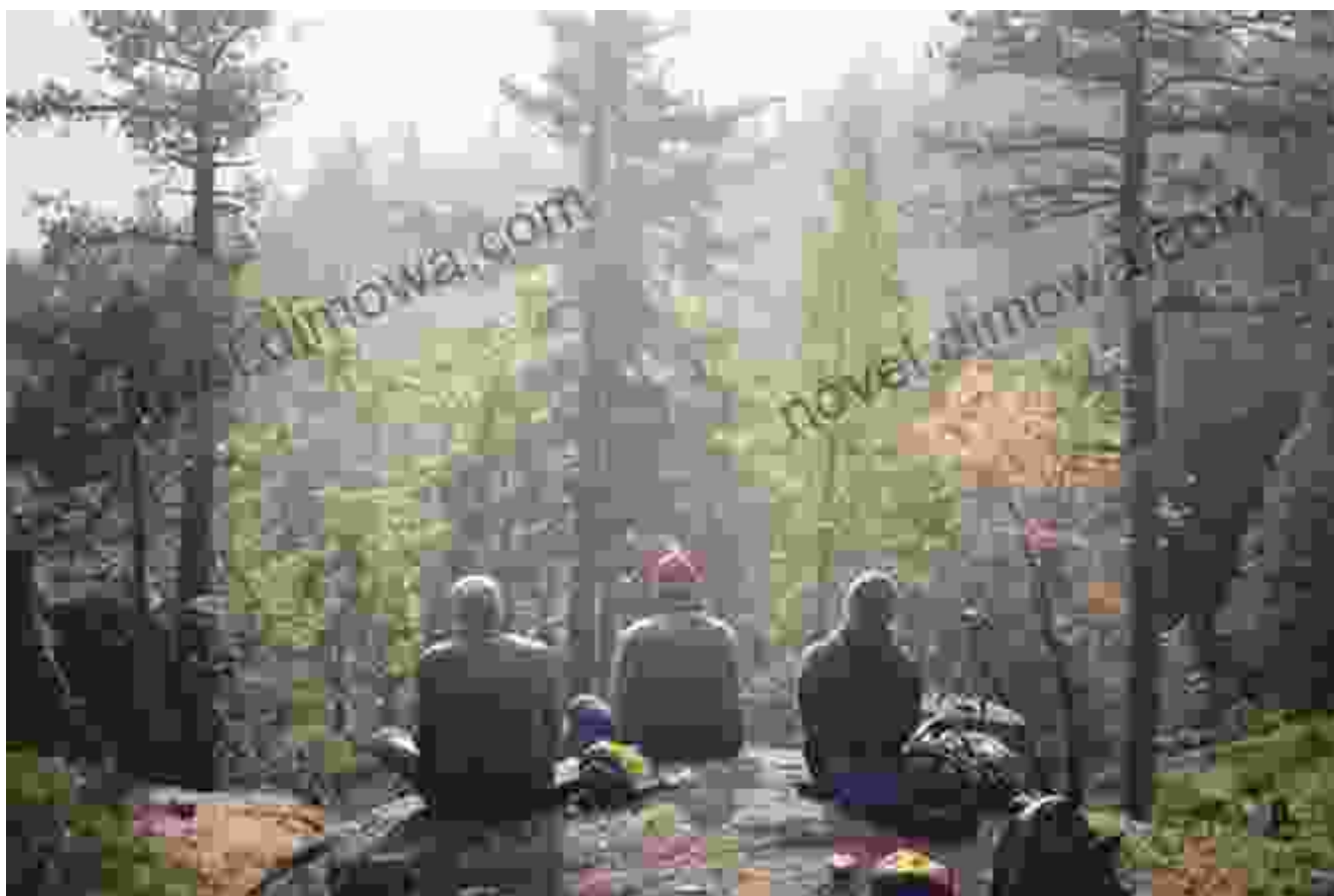
Caption: A group of campers hike through a forest.